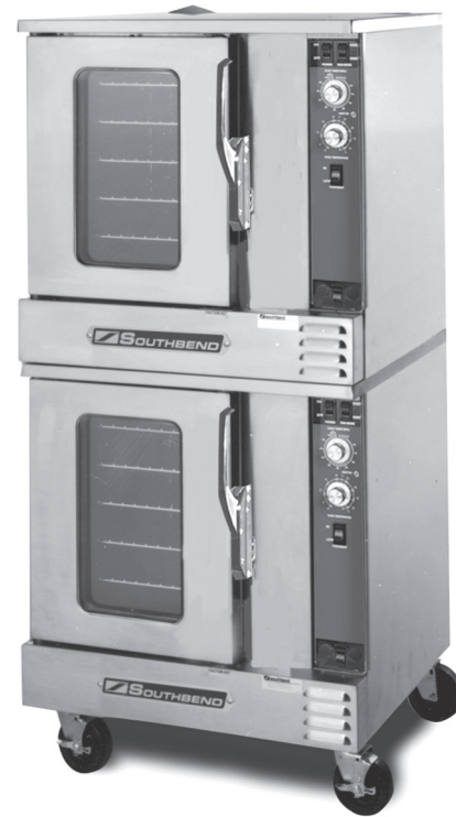
(shown with optional casters)

150°F to 500°F temperature controller with 140°F to 200°F "Hold" thermostat. Dual digital display shows time and temperature. A fan cycle timer pulses the fan.