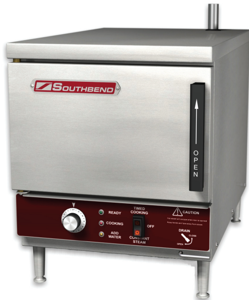
Model shown is an EZ18-3