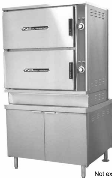
Not exactly as shown