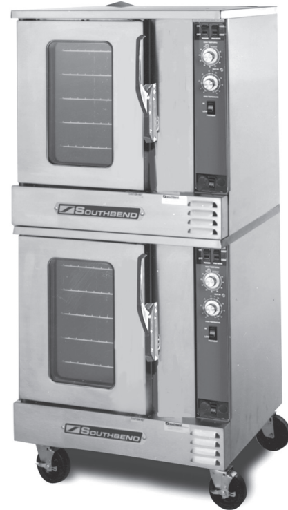
(shown with optional casters)

150°F to 500°F temperature controller with 140°F to 200°F "Hold" thermostat. Dual digital display shows time and temperature. A fan cycle timer pulses the fan.