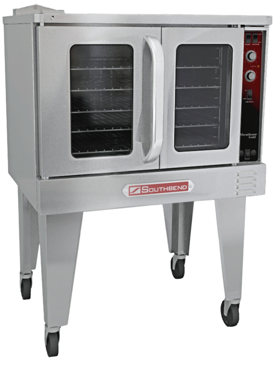
(GS/15SC shown with optional casters)