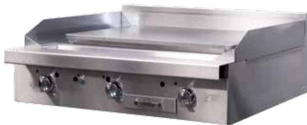
Model Shown P36N-PPP

Plancha units have a raised griddle plate for easy cleaning of cooking surface between loads. 3" wide collection on sides allow separation of waste for preparation of next fare. Plancha griddle is 1/2" thick reinforced steel plate powered by cast iron burners provides fast preheat and recovery time. High heat zone with max temperatures of 800°F located on front 2/3 of plate for quick sear with decreased temps on rear 1/3 of plate for product finishing.