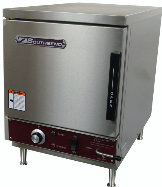
Model shown is an R18A-4M