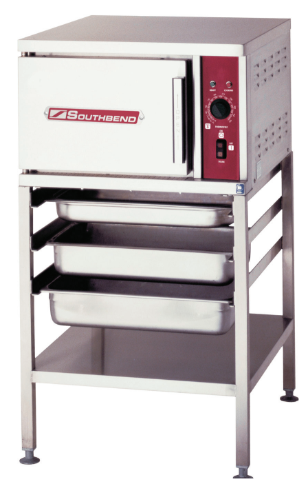
R24-3 shown on optional stand