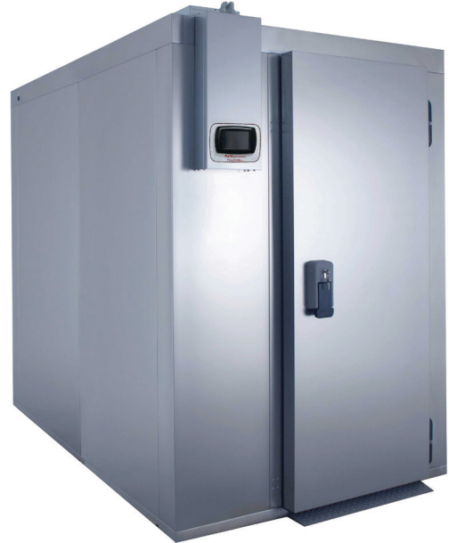
Model shown TC40-BCF-PT