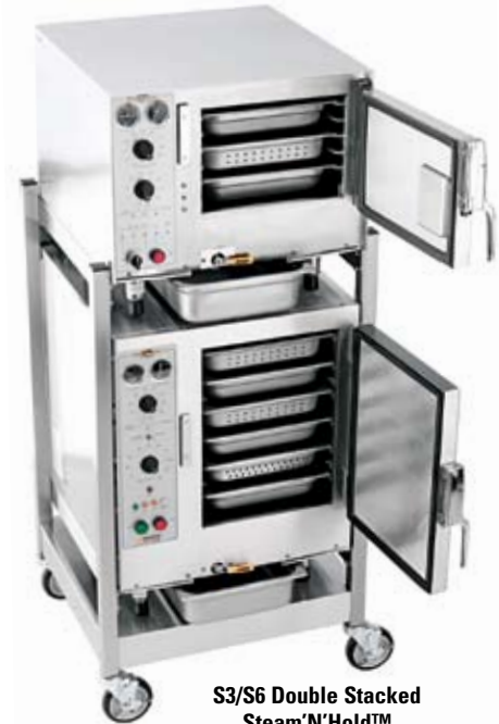
S3/S6 Double Stacked Steam'N'Hold™ Steam Cookers shown with double stack stand (with casters) and 4" drain pans