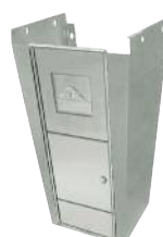
Add Trash Receptacle For 7-PS-33, 7-PS-37 or 7-PS-37B Only 7-PS-29

*Pedestal Base For 7-PS-20 and 7-PS-20-NF Hand Sinks 7-PS-37B