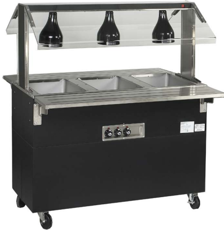
BSW3-120-B-SB Shown with optional lights/heat lamps.