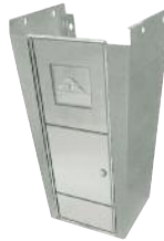
Add Trash Receptacle For 7-PS-33, 7-PS-37 or 7-PS-37B Only 7-PS-29

*Pedestal Base For 7-PS-20 and 7-PS-20-NF Hand Sinks 7-PS-37B