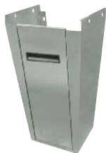
Pedestal Base Only 7-PS-37