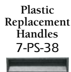
Plastic Replacement Handles 7-PS-38