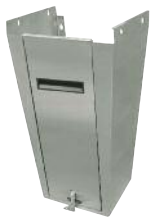
With Foot Valve 7-PS-33