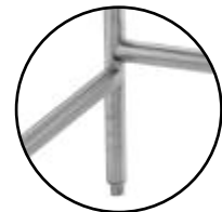
1-5/8" LEG STRETCHERS Ensure Stability