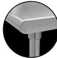
NEW Rolled Rim Edges on Front and Splash on Back and Square Side Edges