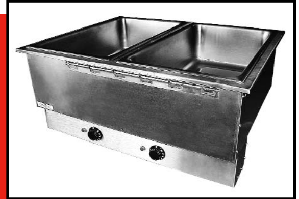
Top Mount Hot Food Well w/ Attached Controls