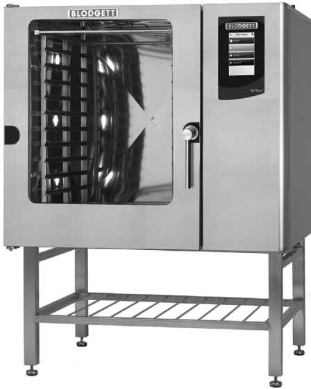
Shown on optional stand with shelf and adjustable feet