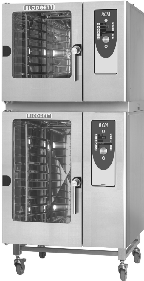
Shown with optional casters