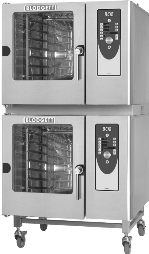
Shown with optional casters

* For all international markets, excluding Canada, contact your local distributor.