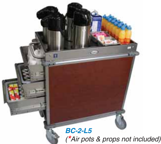
BC-2-L5 (*Air pots & props not included)