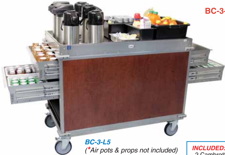
BC-3-L5 (*Air pots & props not included)