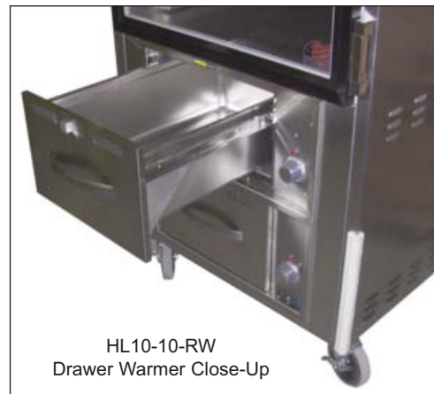
HL10-10-RW Drawer Warmer Close-Up