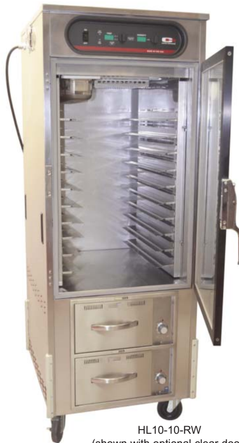
HL10-10-RW (shown with optional clear door)

TEMPERATURE & HUMIDITY CONTROL... Individual dial controls on each drawer for temperature and adjustable front vents to control humidity, allowing food to be hot and crispy in one drawer, warm and moist in another. Temperature range of 90°F to 210°F (32°C-99°C).