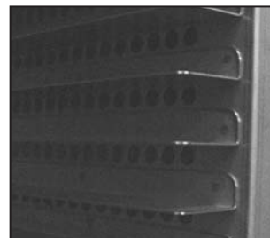
Optional fixed angle slides