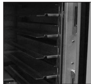
Optional stainless steel adjustable universal slides