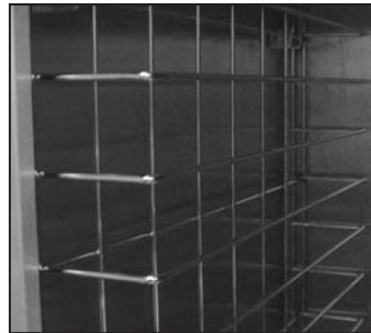
Standard fixed universal wire slides