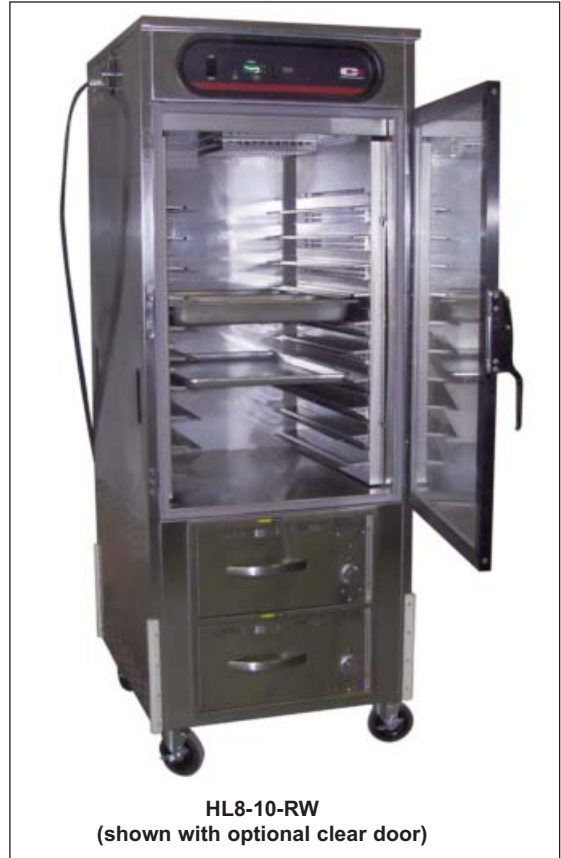
HL8-10-RW (shown with optional clear door)

EASY-TO-USE DIGITAL CONTROLS... Control heat with dial. Temperature range of 85°F to 200°F. Flashing display during preheat mode, turns solid when preheat mode is complete. Temperature display shows user setting. Press temperature dial to display actual temperature. Low temperature light with audible alarm.