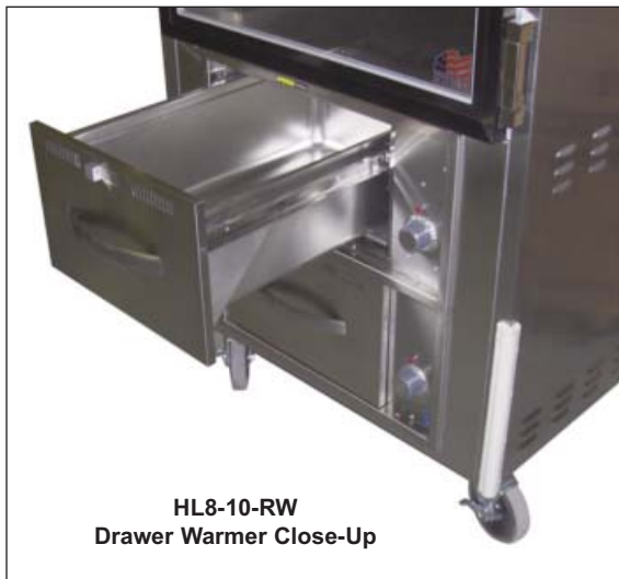
HL8-10-RW Drawer Warmer Close-Up

NARROW DRAWER WARMERS... Keep a variety of food hot and ready to serve. Stainless steel pan provided with each drawer accepts 12"x20" steam table pans up to 6" deep (end-loaded).