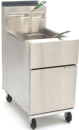
SR62G Shown with optional casters.