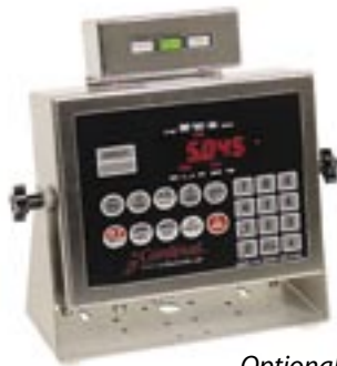
Optional Checkweigher Light Bar for Model 210