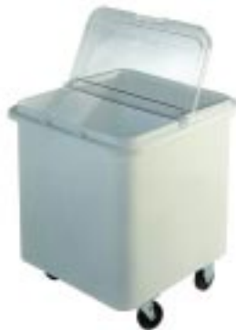
5027 - Ingredient Bin