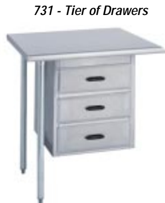
731 - Tier of Drawers