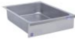
185 - Standard Drawer