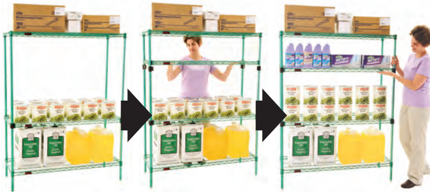
Install an additional shelf without disassembling the entire shelf unit. Unit shown with EAGLEgard® finish.