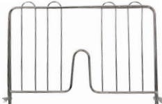
Chrome Shelf Divider