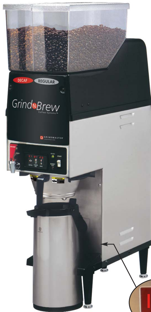
Model 20H (Airpot sold separately)