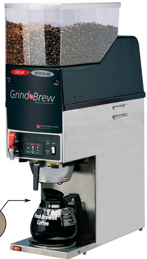
Model 21H (Decanter sold separately)