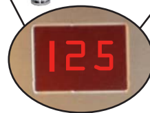
Bean Usage Counter

Digitally controlled Dual Bean Grind'n Brew™ Brewer System. Brewer will maintain brew temperature to \pm 1^\circ\text{F} throughout brew cycle. Brew temperature, brew volume (full and half batch), grind portions (right and left hopper, full and half batch), operator defined pre-infusion/pulse brewing, energy savings and Low Temp/No Brew are programmable from the front display.