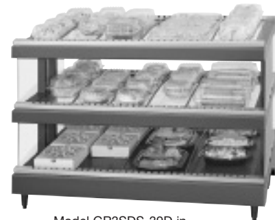
Model GR3SDS-39D in optional Designer color