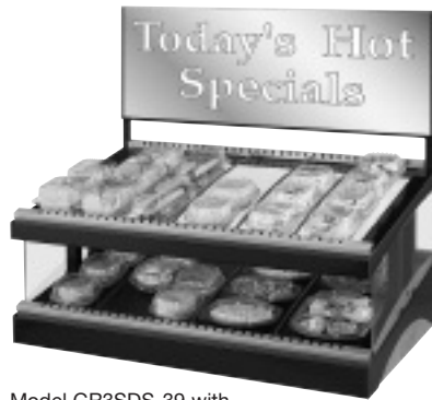
Model GR3SDS-39 with optional Designer color and accessory top sign holder (graphic not included)