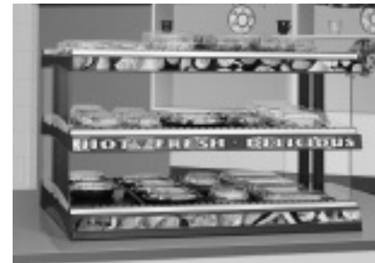
Model GR3SDH-39D with optional Designer color and accessory shelf sign holders (graphic not included)