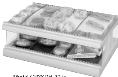
Model GR3SDH-39 in optional stainless steel