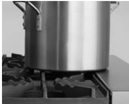
Grates are flush mount to the front ledge for easy sliding across of the entire top surface.