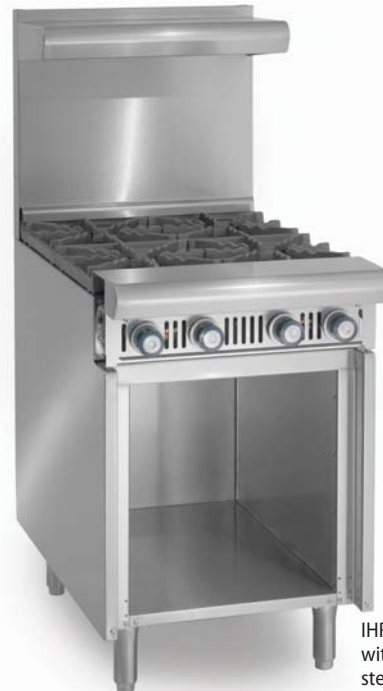
IHR-4-24-XB shown with optional stainless steel backguard and shelf

ADD-A-UNITS - Both floor model (-XB) and modular/countertop (-M) styles are available.