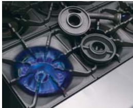
35,000 BTU/hr. (10 KW) anti-clogging, removable burner.

IHR-2-12-XB IHR-2-18-XB IHR-4-24-XB IHR-1HT-12-XB IHR-1HT-18-XB IHR-2HT-24-XB IHR-G12-XB IHR-G18-XB IHR-G24-XB IHR-GT12-XB IHR-GT18-XB IHR-GT24-XB