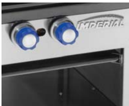
3-ring burner has 2 adjustable gas valves to control inner and outer rings.