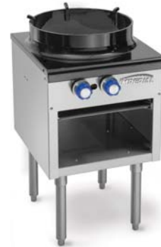
ISP-18-W Tempura Wok Range