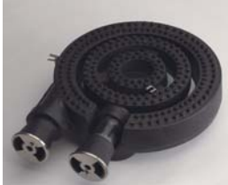
3-ring burner for high performance cooking.

ISPA-18 ISPA-18-2 ISP-J-SP ISP-J-SP-2 ISP-18-W ISP-J-W-16 ISP-J-W-13