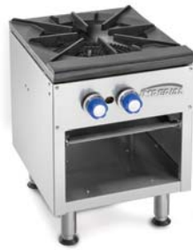
ISPA-18 Stock Pot Range