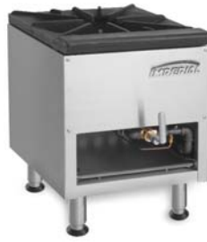
ISP-J-SP Hi-Temp Stock Pot Range