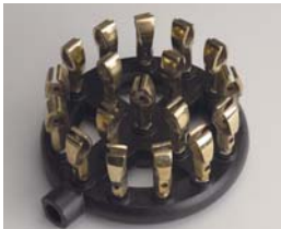
Anti-clogging jet burners produce a cone shaped intense flame.