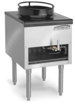
ISP-J-W13 Mandarin Wok Range