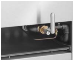
Steel lever offers maximum control for jet burner.