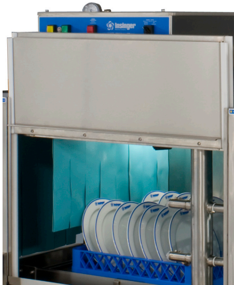
Telescoping Doors —no issues with low ceilings. The doors also provide wide access to the interior of the machine for quick and efficient daily maintenance.