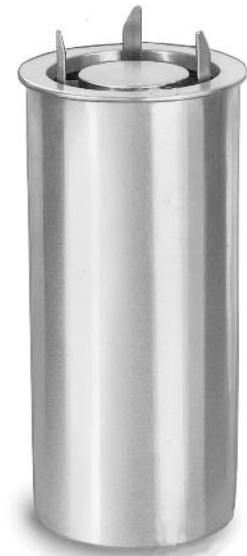
Model 923 Shielded