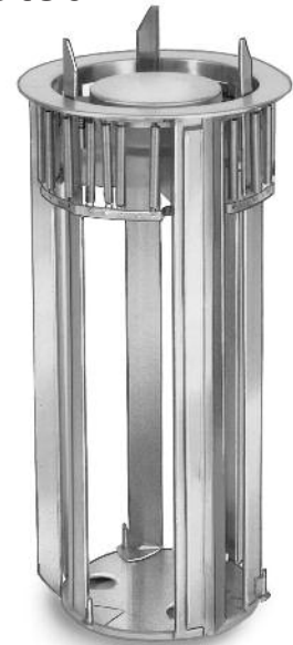
Model 922 Open