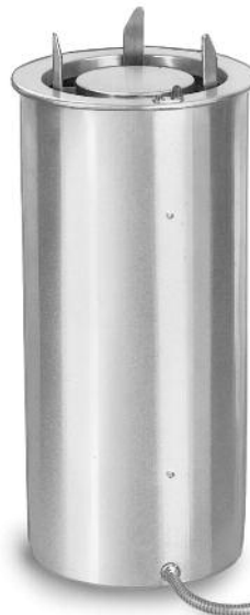
Model 924 Heated