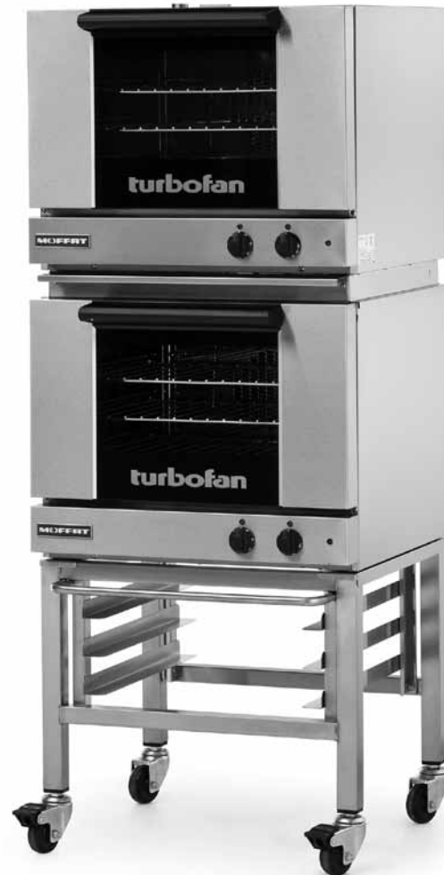
Model E22M3/2C shown