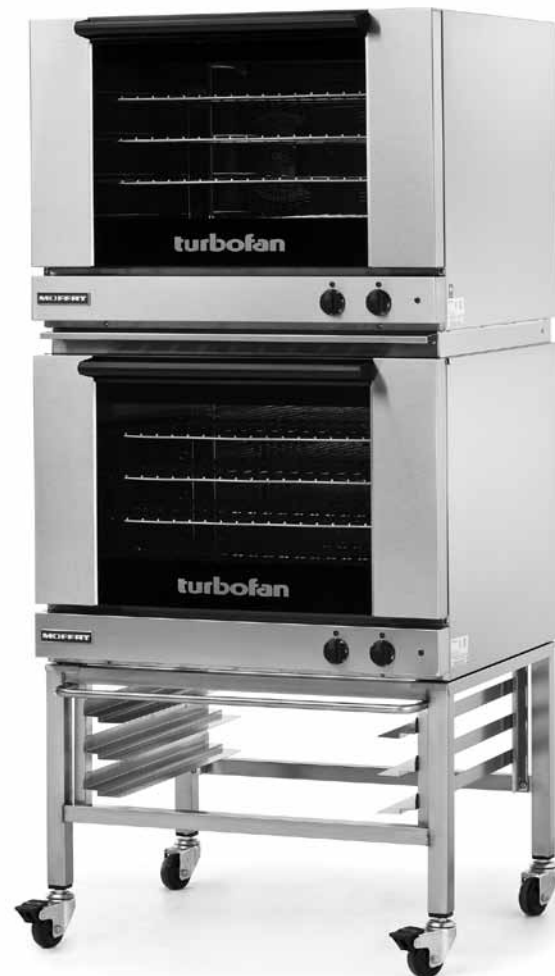
Model E28M4/2C shown