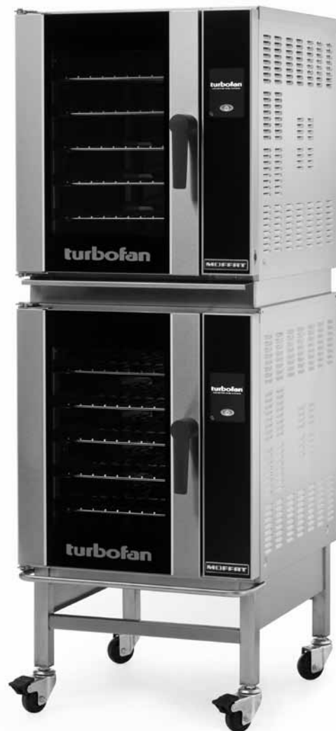
Model E33T5/2C shown

Double stack models are supplied as two individual ovens and a double stacking kit for field assembly.