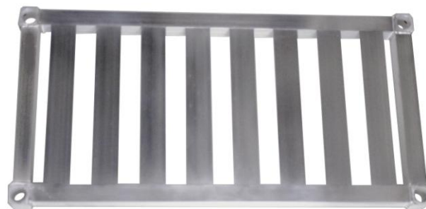
Adjust-A-Shelf – T-Bar Series