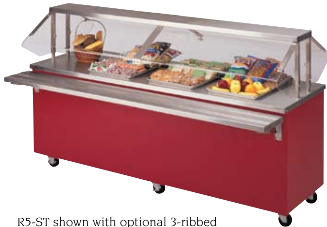
R5-ST shown with optional 3-ribbed tray slide and BPG protector guard

The Reflections Solid Top units are ideal for use as worktops, for plating and for sandwich and salad preparation. This unit can also be used as a counter for other serving and merchandising needs.