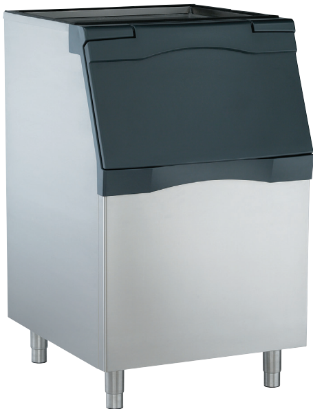
B530S shown with optional KLP8S legs