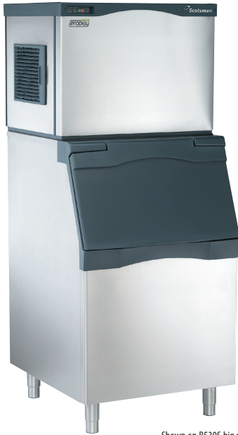
Shown on B530S bin with optional KLP85 legs.