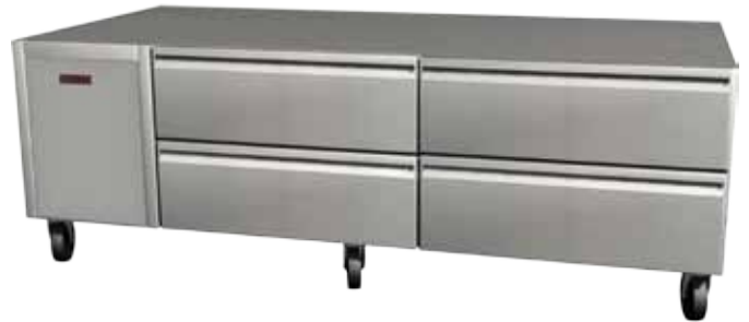
(Model 20072RSB with optional casters)

20032RSB (32" wide); 20036RSB (36" wide); 20048RSB (48" wide); 20060RSB (60" wide); 20064RSB (64" wide); 20072RSB (72" wide); 20084RSB (84" wide); 20096RSB (96" wide); 20108RSB (108" wide)