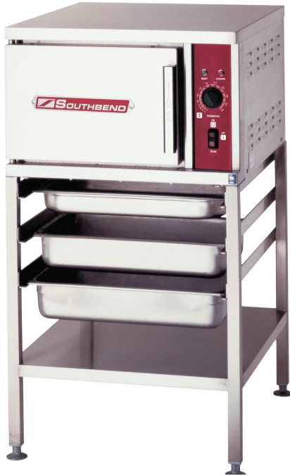
R24-3 shown on optional stand