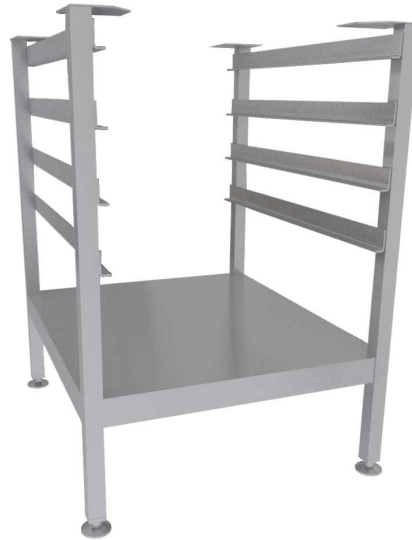
MODEL RL-34 SHOWN

Models: RL-18 RL-23 RL-28 RL-28G RL-28X RL-28XN RL-34 R18SS-3 R18SS-4 R18SS-5 S-EPXSS-1 S-EPXSS-2