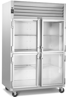
Model RHT232NUT-HHG (shown with optional casters)