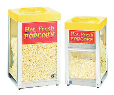
15NCPW 12NCPW Popcorn Merchandiser/Warmer