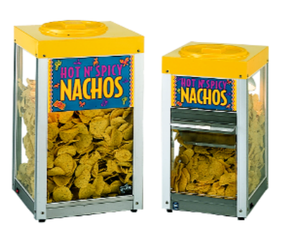
15NCPW 12NCPW Nacho Chip Merchandiser/Warmer

Star's Merchandiser Warmers are covered by a one-year parts and labor warranty.