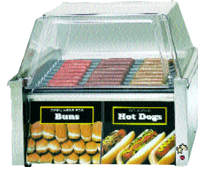
Model 30SCBD with Sneeze Guard