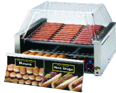
Model 50CBD with Sneeze Guard