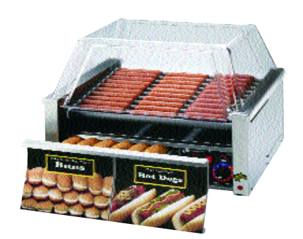
Model 50CBD with Sneeze Guard