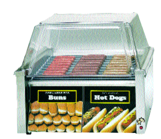
Model 30SCBD with Sneeze Guard

Grill-Max Roller Grills are covered by Star's one-year parts and labor warranty.