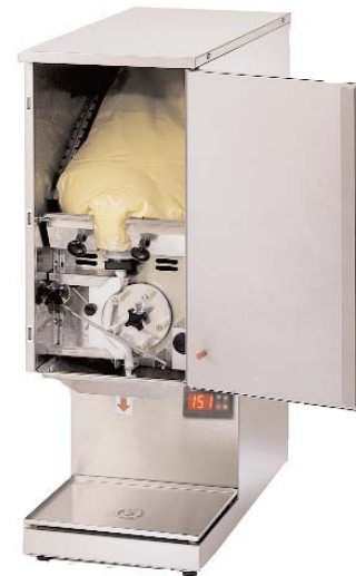
Model SPDE1HP Open (Cheese Not Included)