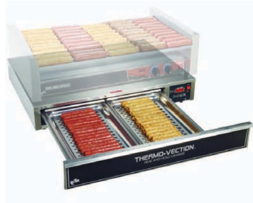
Model TVD50 shown with roller grill (sold separately)