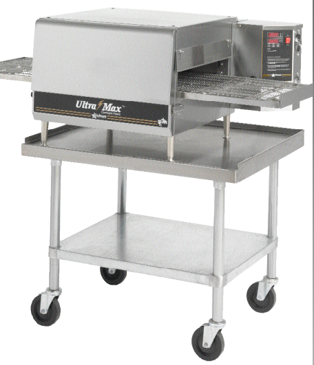
UM-1833A with Optional Stand